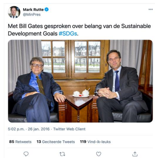
@MinPres. (2016, January 26). Retrieved from Twitter.

Another example of a fear-provoking tweet is the one below, containing a video in which a claim is made about the COVID-19 software. The person in the video claims that, COVID-19 software has been installed automatically in our phones, and that from now on, it will be easy for the government to install the tracking app on our phones. A lot of panicking comments of people concerned about their privacy were elicited. The official website of Apple explains that