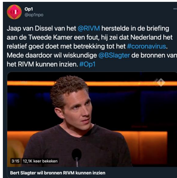
@op1npo (2020, May 2) Retrieved from Twitter.

study. Furthermore, Slagter states that the x- and y-axes are not important in the graph, which is not true, because axes allow readers to interpret a graph objectively (Yang et al., 2020). Therefore, his statement that 'The Netherlands is one of the countries with the highest death rates' is a wrong interpretation, as the axes showed that rate was per capita. In short, this example visualises that even prestigious sources can be part of spreading fake news.