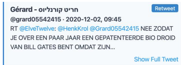
[Translation] "So that in a few years you are a patented bio droid of Bill Gates.." Retrieved from foller.me